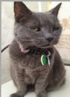
Maxine LeSaux's Cat-Beauty