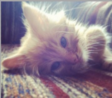
Pam Pangaro's Kitten Penny